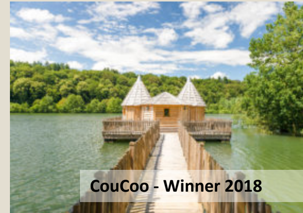
CouCoo - Winner 2018

CouCoo - Grands Chênes, le luxe à l'état sauvage www.coucoco.com