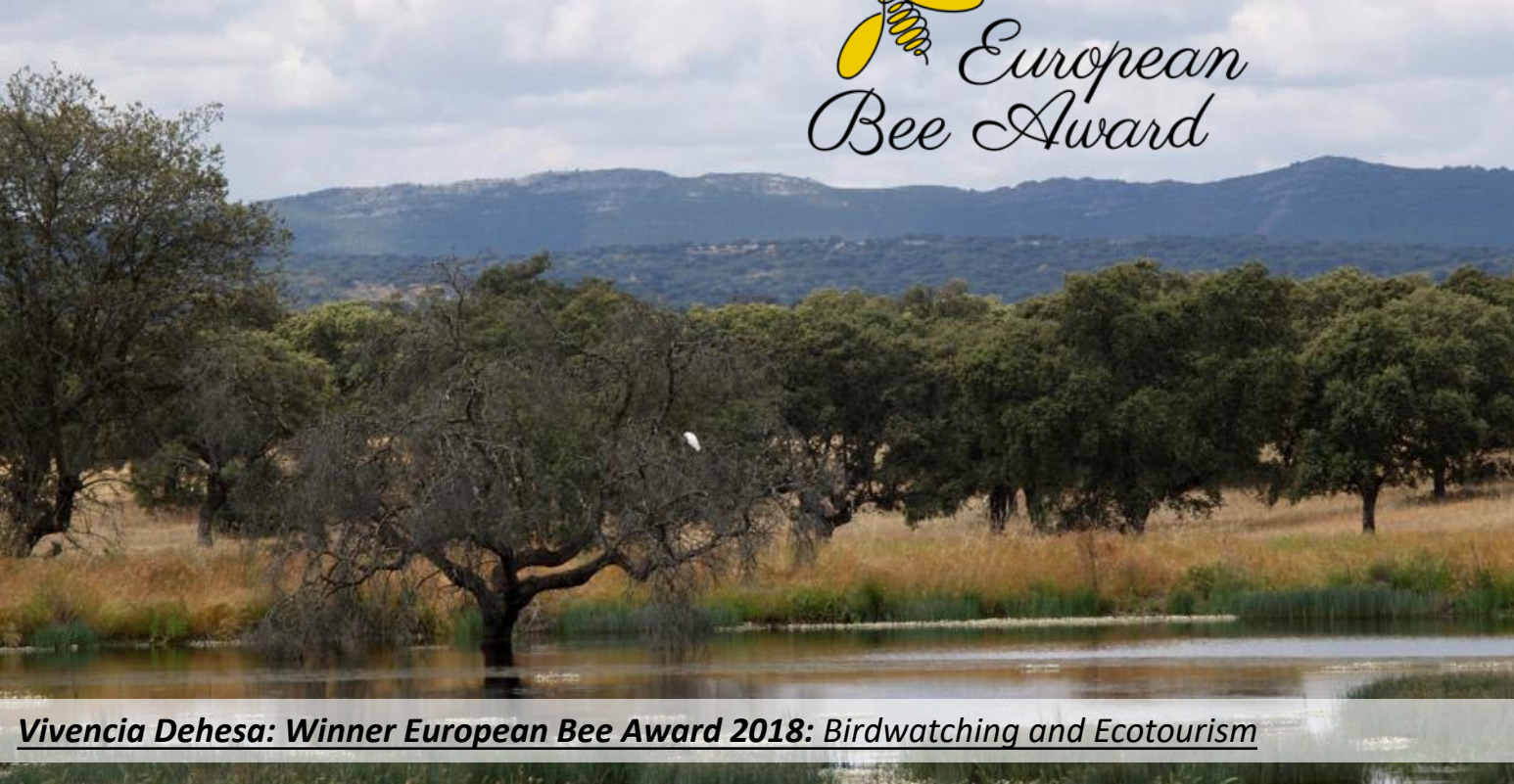
Vivencia Dehesa: Winner European Bee Award 2018: Birdwatching and Ecotourism

Bee Award – An award committed to find common solutions for the benefit of biodiversity by rewarding projects protecting pollinators